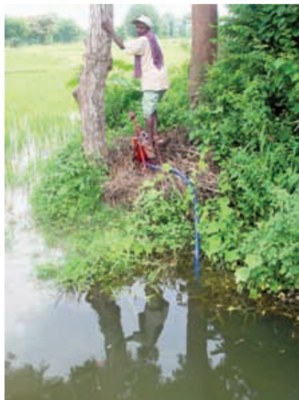
Micro-irrigation using a step-pump

Whilst watershed management activities have brought many benefits, there is a danger that they may also contribute to unintended consequences, including reduced inflows to traditional tank systems, catchment closure and groundwater overdraft. Given that there is limited scope for increasing water resources, the emphasis needs to shift towards improved management of existing water resources and, in particular, ensuring that allocation of water to meet primary needs has priority. This requires an efficient and equitable water governance system for using and allocating available water resources. APRLP has contributed in this area, developing tools such as water audits, which can assist decision makers to make informed decisions about water, taking into account issues of equity, sustainability and efficiency.